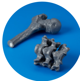
Standard Resins for High-Detail Models

“Formlabs tools are game changing. My Formlabs printer is my first line when I want a rapid, high resolution print. It is in every sense my right-hand printer and resides in my office. The interface allows individuals in my lab to quickly become comfortable with operations and the versatility of the material choices has allowed for tremendous innovation for our group.”