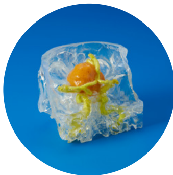
Clear Resin for Rigid, Translucent Models