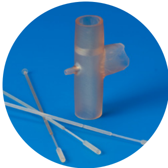
Surgical Guide Resin for Experimental Applications