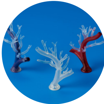
Elastic Resin for Flexible, Translucent 3D Printed Anatomy